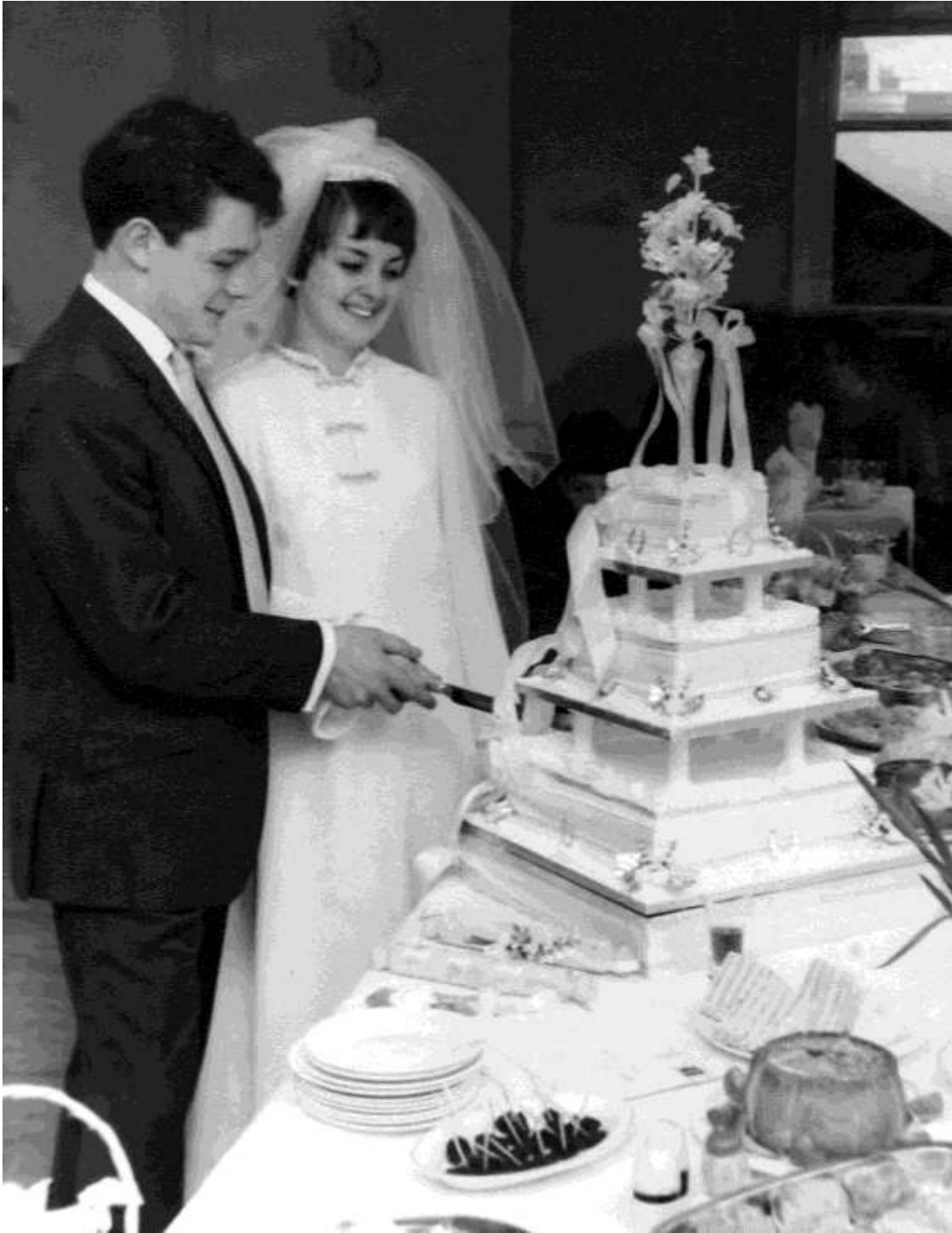
We cut the cake