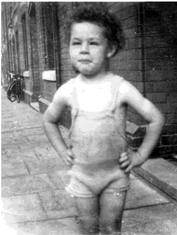
Cheeky kid in King Street