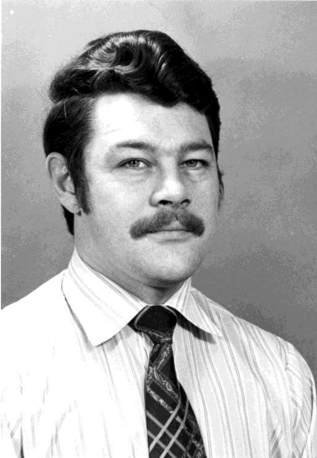
Canada-bound, March 1976