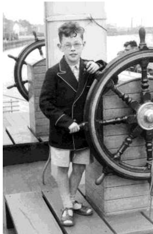
On holiday in Great Yarmouth, c. 1954