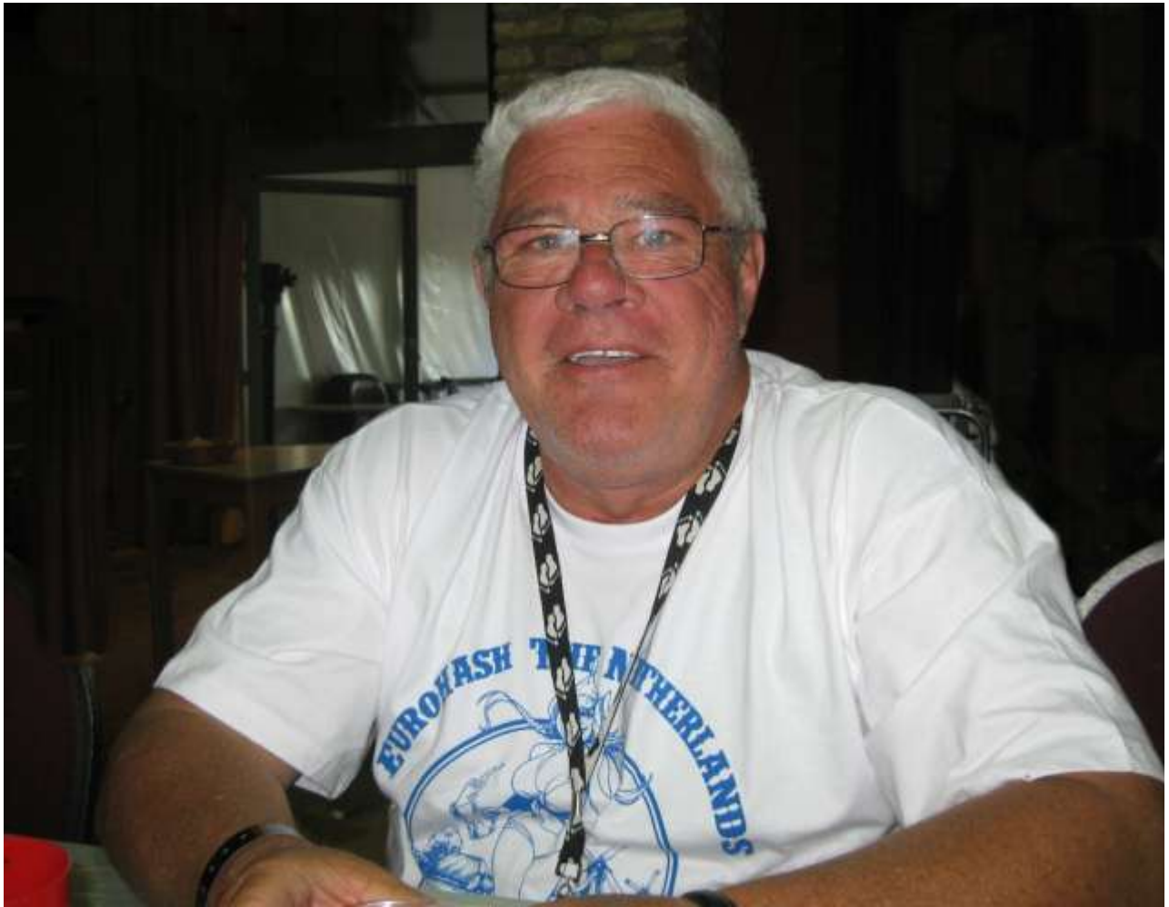
Hashing in Amsterdam, May 2011