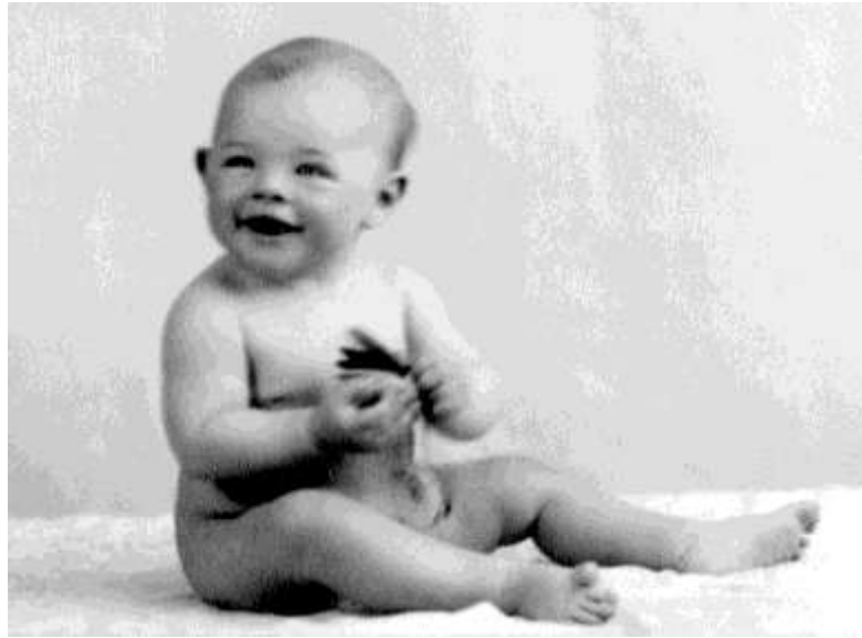
My first portrait