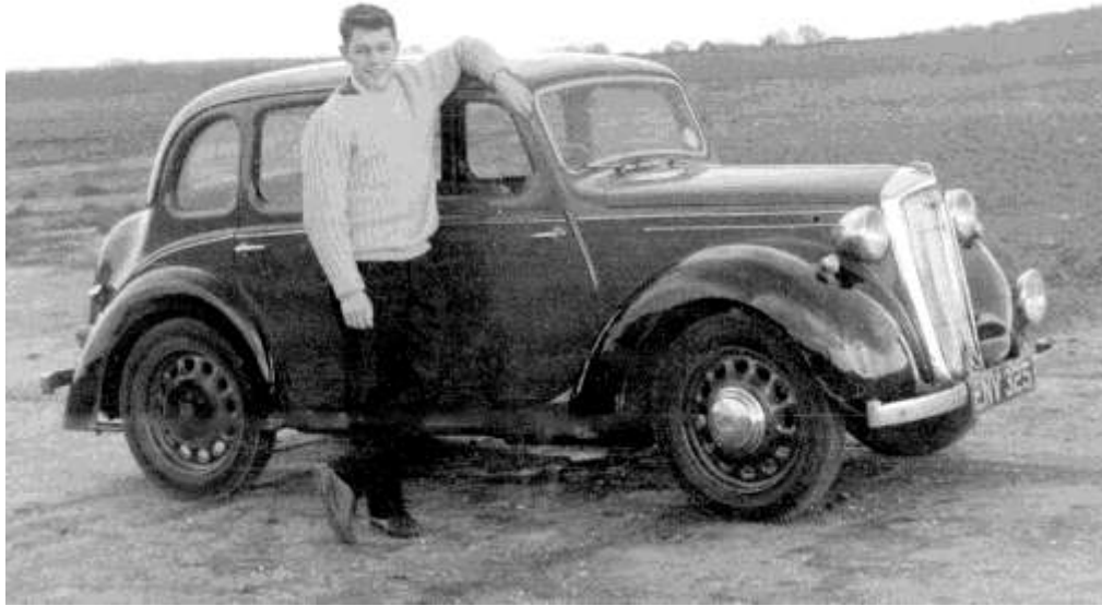
My 1948 Wolseley 10