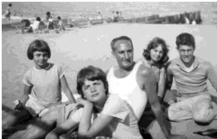
At Great Yarmouth with the Wrights about 1960.