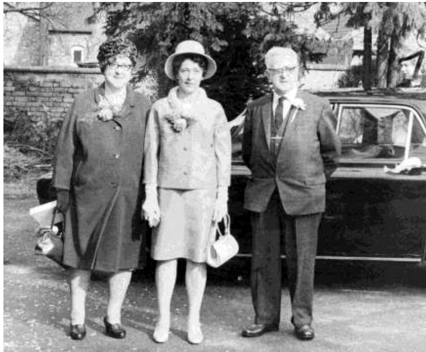
Beat, Mum and Pop arrive at the church