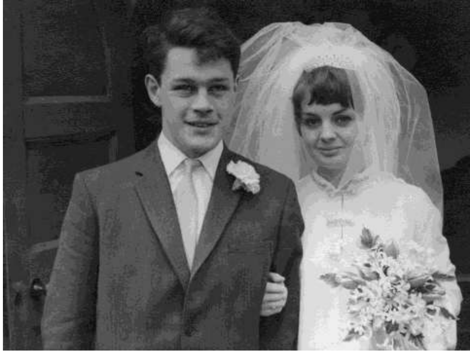
We were married on March 23rd, 1968